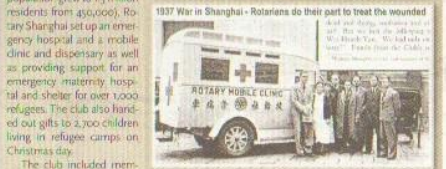
1937 War in Shanghai - Rotarians do their part to treat the wounded

In June 1997 and early 1998 Rotarians began to meet again at the Hilton Hotel and by 1999 formal meetings were established. After donating funds to various causes, in late 2000 Rotary Shanghai began its first long-term social service project, Gift of Life. In 2005 Rotary Shanghai once again received club status.