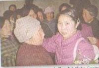
Children in Shanghai